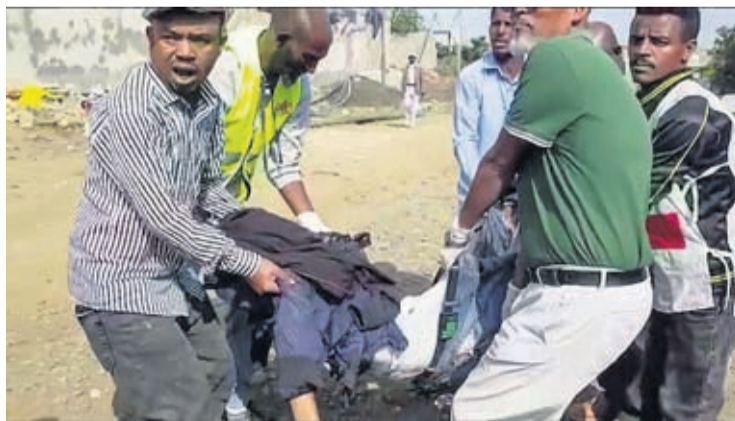
In this image made from video, medics carry the body of a dead or injured victim of an airstrike in Mekele, capital of the Tigray region of northern Ethiopia Wednesday, Sept. 14, 2022.

That calm had allowed more humanitarian aid to reach the long-blockaded Tigray region, but those deliveries have now been halted, according to the United Nations. Deliveries to conflict-affected parts of the neighboring Amhara region have also stopped. Since the conflict broke out in November 2020, tens of thousands are believed to have been killed and millions displaced in the Tigray, Amhara and Afar regions. □